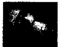
Jacketed End Suction Process Pumps