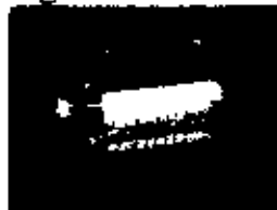
Side Channel Pumps