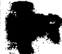
End Suction Pump