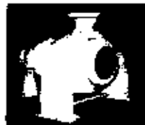
Centre Line Mounted & Canned Motor Process pumps